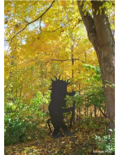
Olaf Oskar Smork

https://en.wikipedia.org/wiki/In_the_Hall_of_the_Mountain_King , https://www.youtube.com/watch?v=r_Dk4oWGJQ